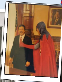
Captain Energy And Iowa Governor Terry Branstad