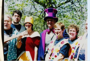
Gov. Tom Vilsack & LG Sally